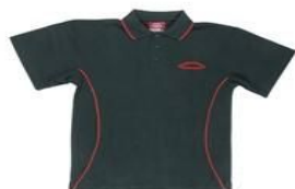
Unisex Green Polo Shirts Compulsory $29.00