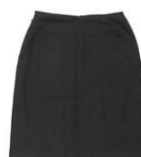
Girls Skirt Optional $53.50