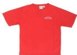
PE T-Shirt Compulsory $31.00