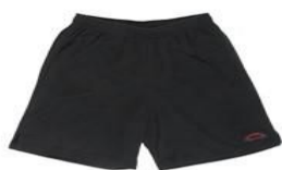
PE Shorts Optional $27.00