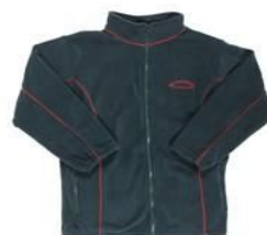
Unisex Polar Fleece Jacket Optional $67.50