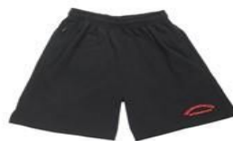
Unisex Shorts Compulsory $36.00